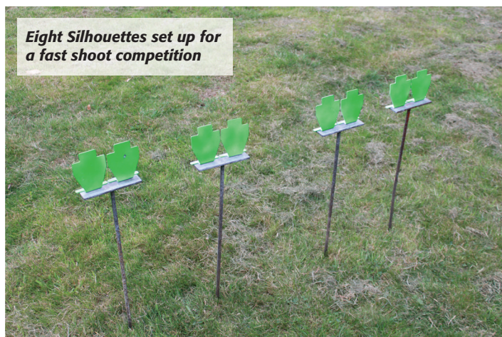
Eight Silhouettes set up for a fast shoot competition