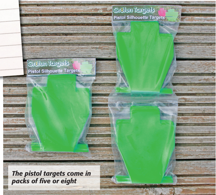
The pistol targets come in packs of five or eight