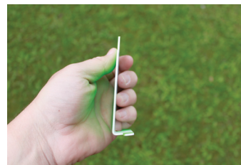
The targets are made out of 2mm thick steel plate